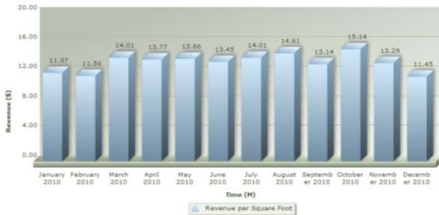
Revenue per Square Foot